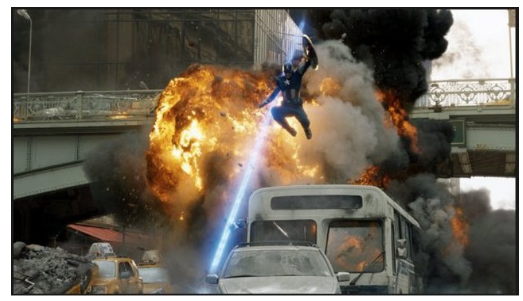
Green Screen Used in "The Avengers" Preproduction Final shot