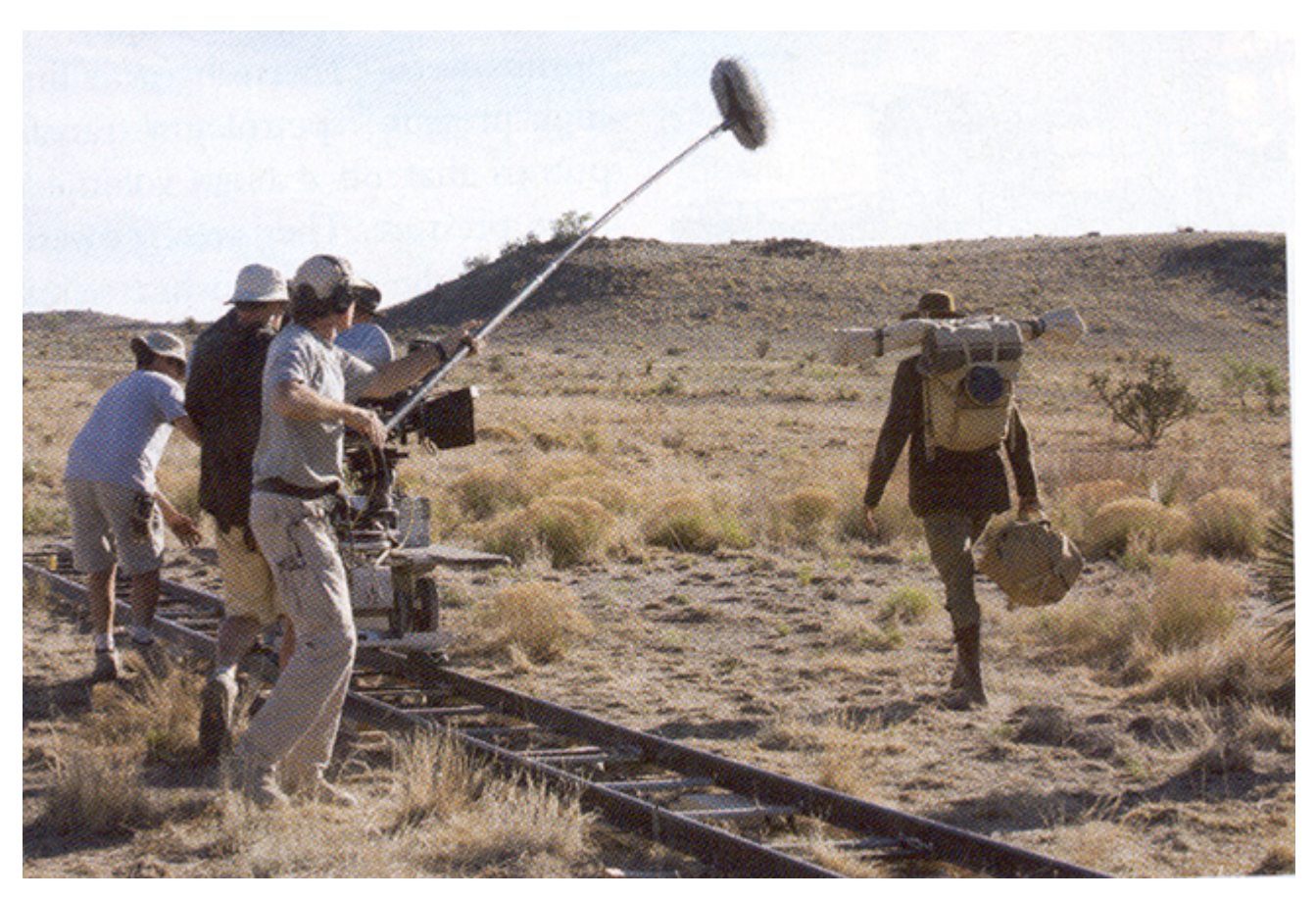
Publicity still from the making of "There Will Be Blood"