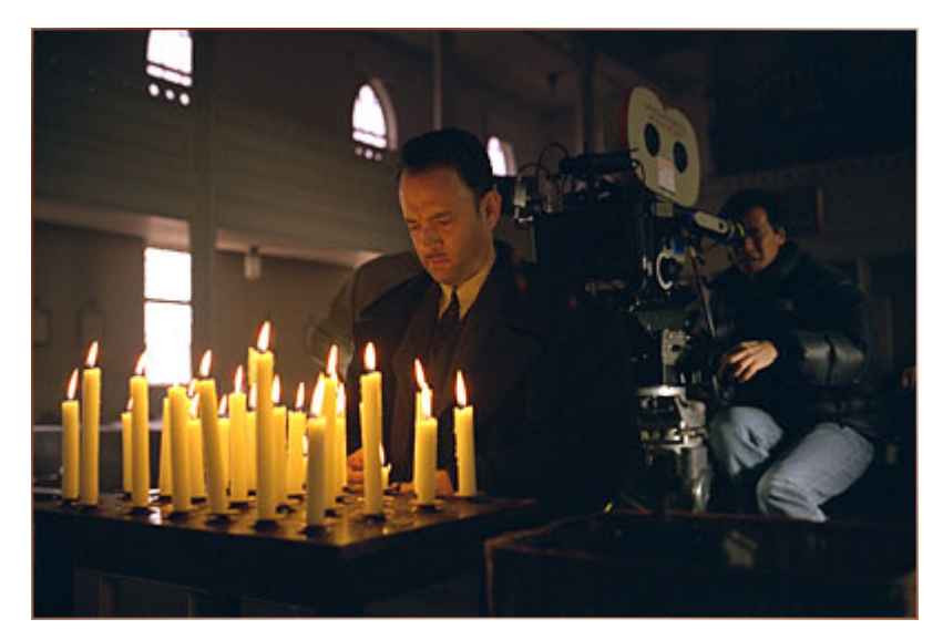
Camera pulls slowly up to actor Tom Hanks in "The Road to Perdition"