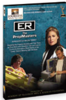
ER The PropMasters