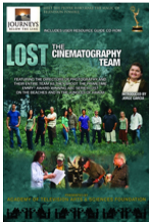
LOST- The Cinematography Team