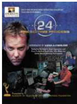
24 Behind the Scenes The Editing Process