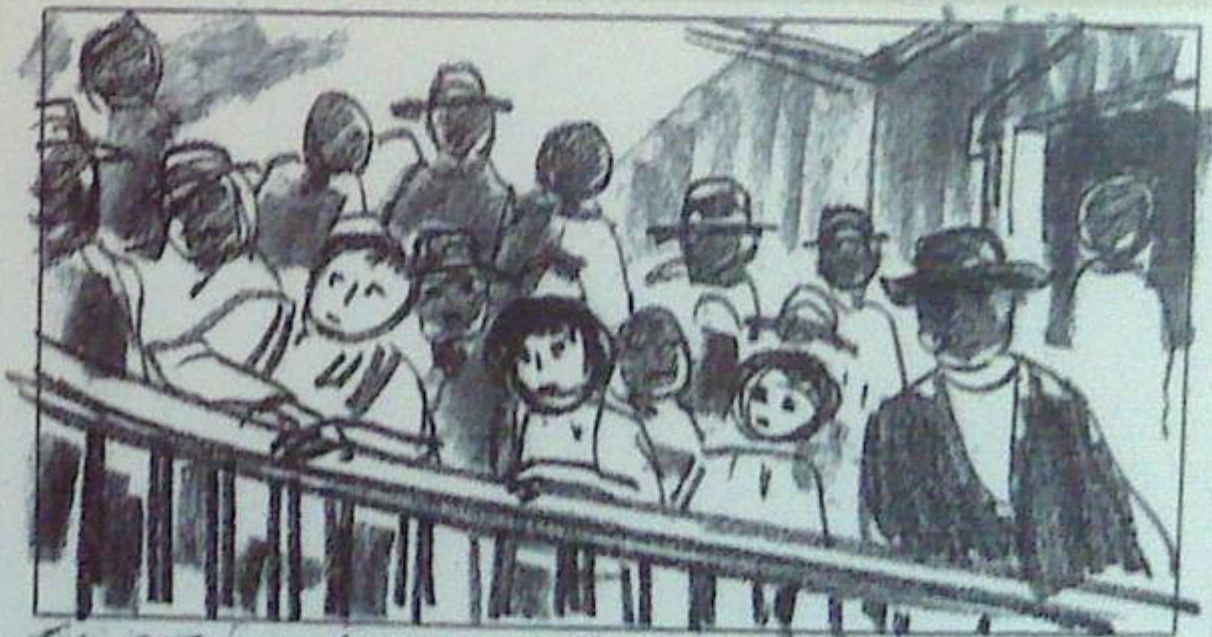
SG. 217 - COLORED BALCONY - GROUP SHOT.