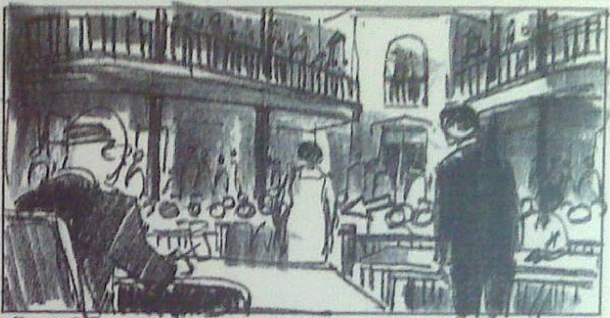
SG. 255 - CALPURNIA - JUDGE AND ATTICUS - CALPURNIA & ATTICUS LEAVE.